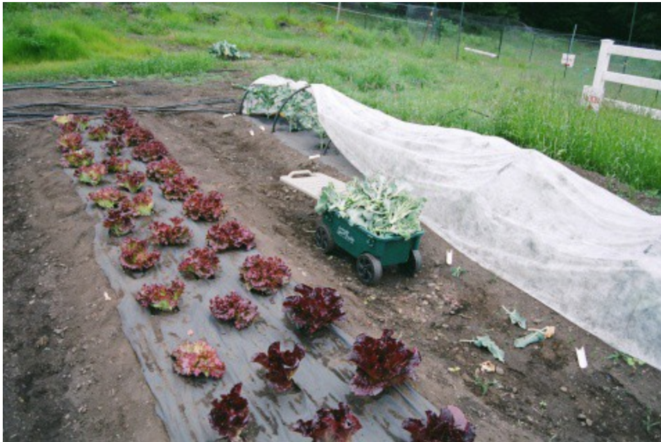
Lettuce and Broccoli (under floating row covers)